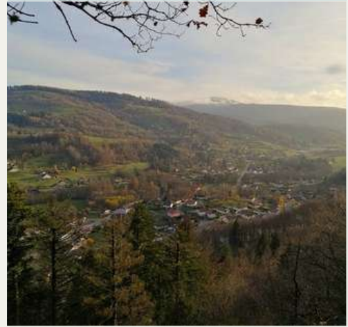
View of the village of Ménil

“The Grande Roche and the Heuchau Waterfall allow you to enjoy the full diversity of the Vosges landscapes in a short distance. A walk for lovers of unspoiled nature who want to get a breath of fresh air.”