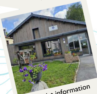
Tourist information office in Le Ménil