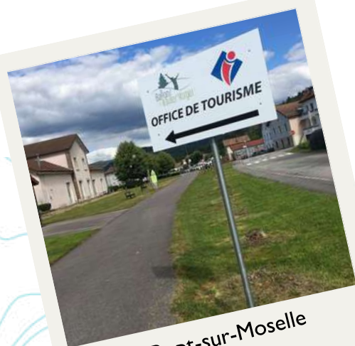
Rupt-sur-Moselle Tourist Office