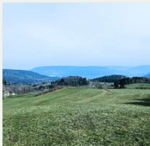
View of the Remiremont region from the summit of La Beuille

“This short walk is ideal to discover the heights of Rupt-sur-Moselle, just a stone's throw from the Plateau des Mille Étangs and the verdant Remiremont region, dominated by the Massif du Fossard.”