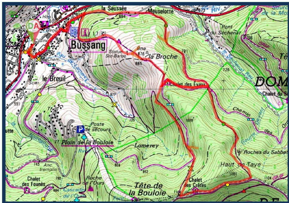
© IGN - 2020 - Autorisation n° 70.20010 - Copie et reproduction interdite.

Green point - yellow point - yellow diagonal cross - red triangle